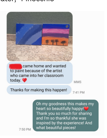
Elk Ridge Elementary