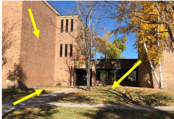
Figure 2: Dimensions of Ground Locations Available for Project Aspect 1