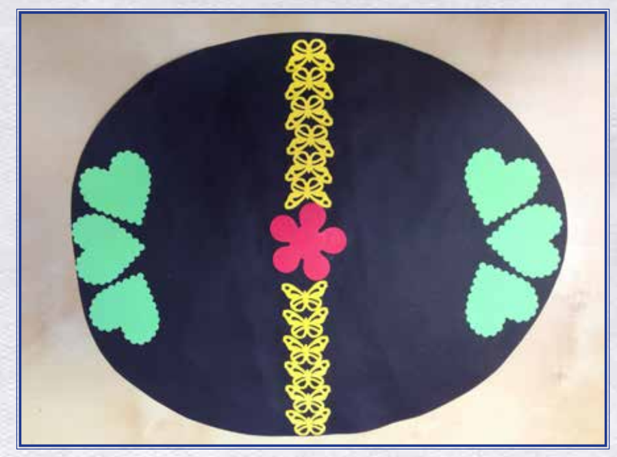
Paper pysanka made with paper punches by a resident in an elder care facility in Jamestown, ND.