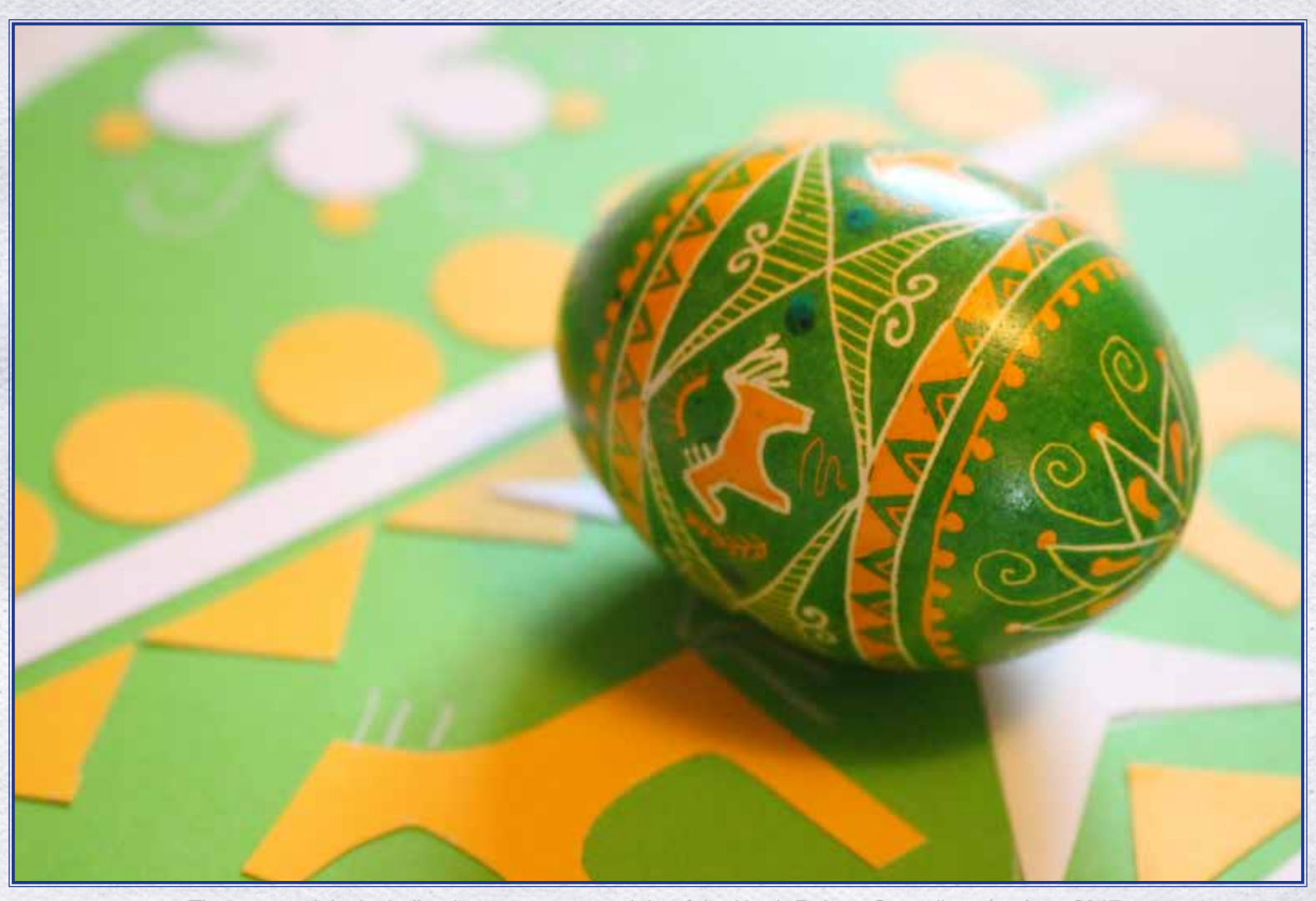
These materials, including images; are copyright of the North Dakota Council on the Arts, 2017.